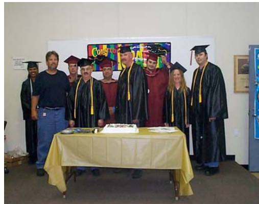
UAW-DaimlerChrysler Sterling Heights Assembly Plant Graduation

Baker College Corporate Services Newsletter 1050 W. Bristol Rd. Flint, MI 48507 Distribution: 810-766-4242