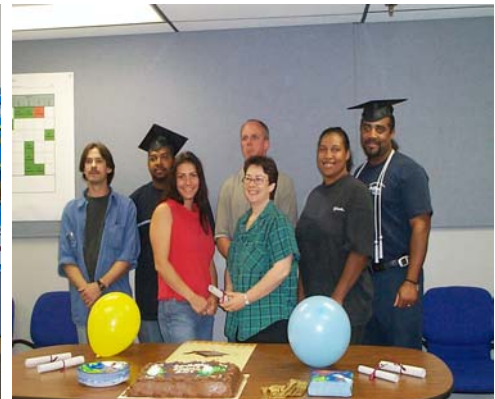
UAW-DaimlerChrysler Mt. Elliott Tool and Die Graduation