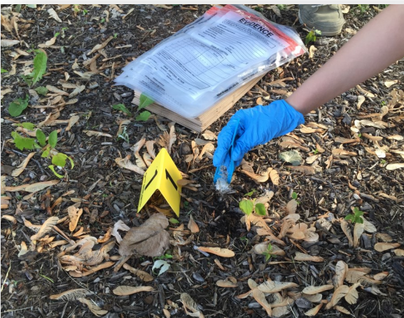
Criminal Justice students participated in a mock crime scene on campus.