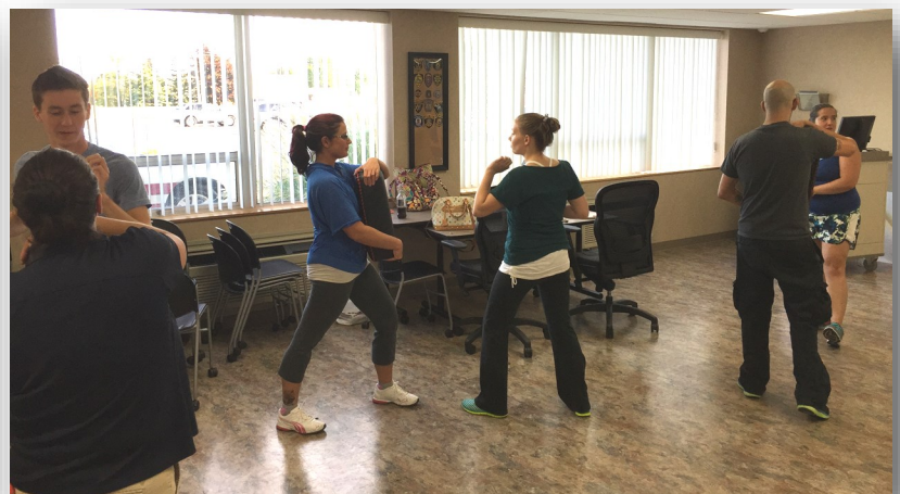
Criminal Justice students refreshed their skills at a Defensive Tactics Workshop hosted by the Criminal Justice Student Organization.