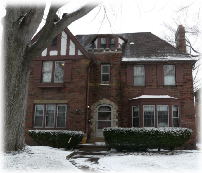
Historic home in Palmer Park, Detroit presents a new challenge for interior design students.