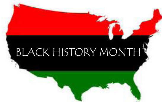
See the flyer on the main Baker College of Owosso webpage for more information.