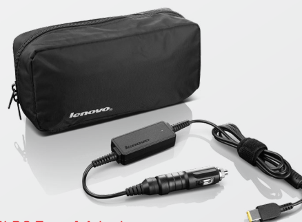
Lenovo® 65W DC Travel Adapter