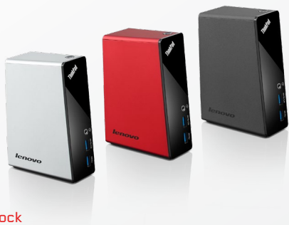
ThinkPad® OneLink Dock