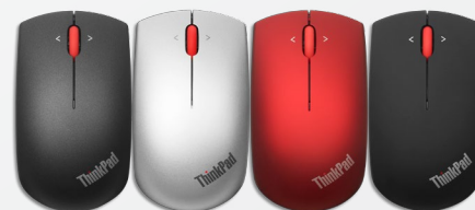
ThinkPad® Wireless Precision Mouse