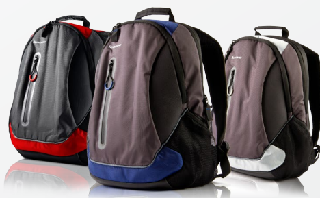
Lenovo® Sport Case